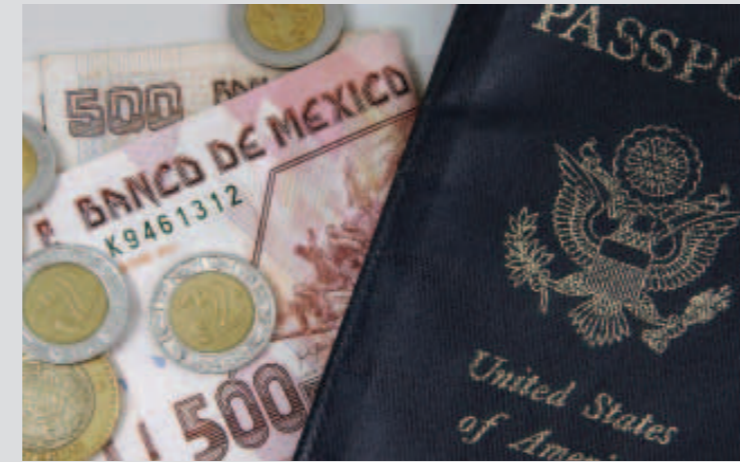
Concierge Services - Visa & Immigration